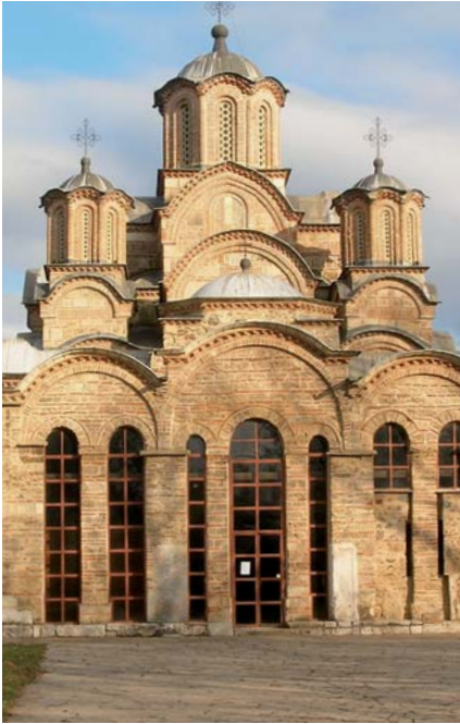
Church in Kosovo

bilateral or multilateral agreements, national state laws and other legal instruments. Beside laws, it is also necessary to develop appropriate regulations. At present, the opposing global and regional political interests paralyze or undermine the efforts to successfully solve the problems connected with protection and security of persons and buildings. Protecting cultural heritage in Kosovo and Metohija, particularly the still threatened Christian heritage, is a great challenge and an obligation for modern Europe, even more so as many of these sites are sacred places.