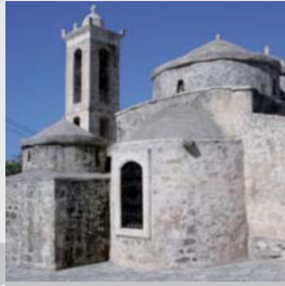
HOLY PLACES OF CYPRUS