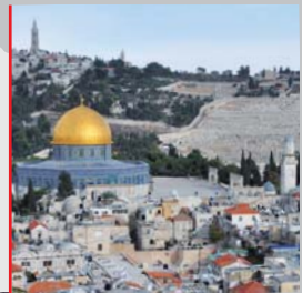
HOLY PLACES OF JERUSALEM