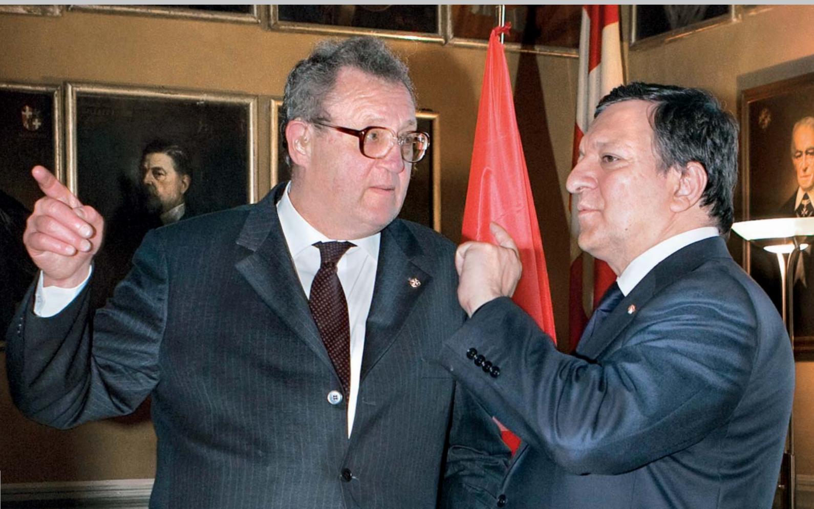
The Grand Master of the Order of Malta Fra' Matthew Festing and the President of the European Commission José Manuel Barroso, during his visit to the seat of the Sovereign Order of Malta in 2009.