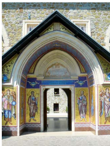
Church in Cyprus

In Kosovo, religion has been an integral part of the history and life of society over all ages. The region where both Illyrians and Dardanians lived was among the first territories where Christianity spread. Dioceses in this territory have a sixteen centuries old tradition. After the battle of Kosova in 1389, the majority of the population progressively converted to Islam but Orthodox and Catholic churches in the country remained active. Today, local cultural and religious heritage is dealt with in a variety of legal instruments. Kosovo's current legal framework is made up of documents produced as a result of international conferences on the country, proposals for the definition of its political and legal status (the Ahtisaari package) and of local legislation. According to its Constitution, Kosovo is a secular State with a neutral approach to religious matters, whose laws ensure and protect religious autonomy and religious monuments within the territory. Under the Cultural Heritage